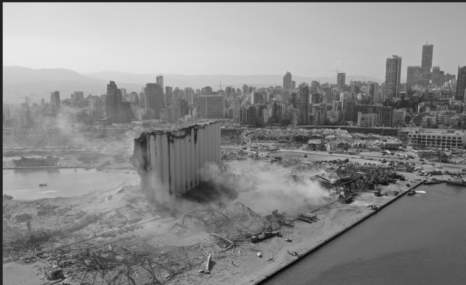
*August 26, 2020