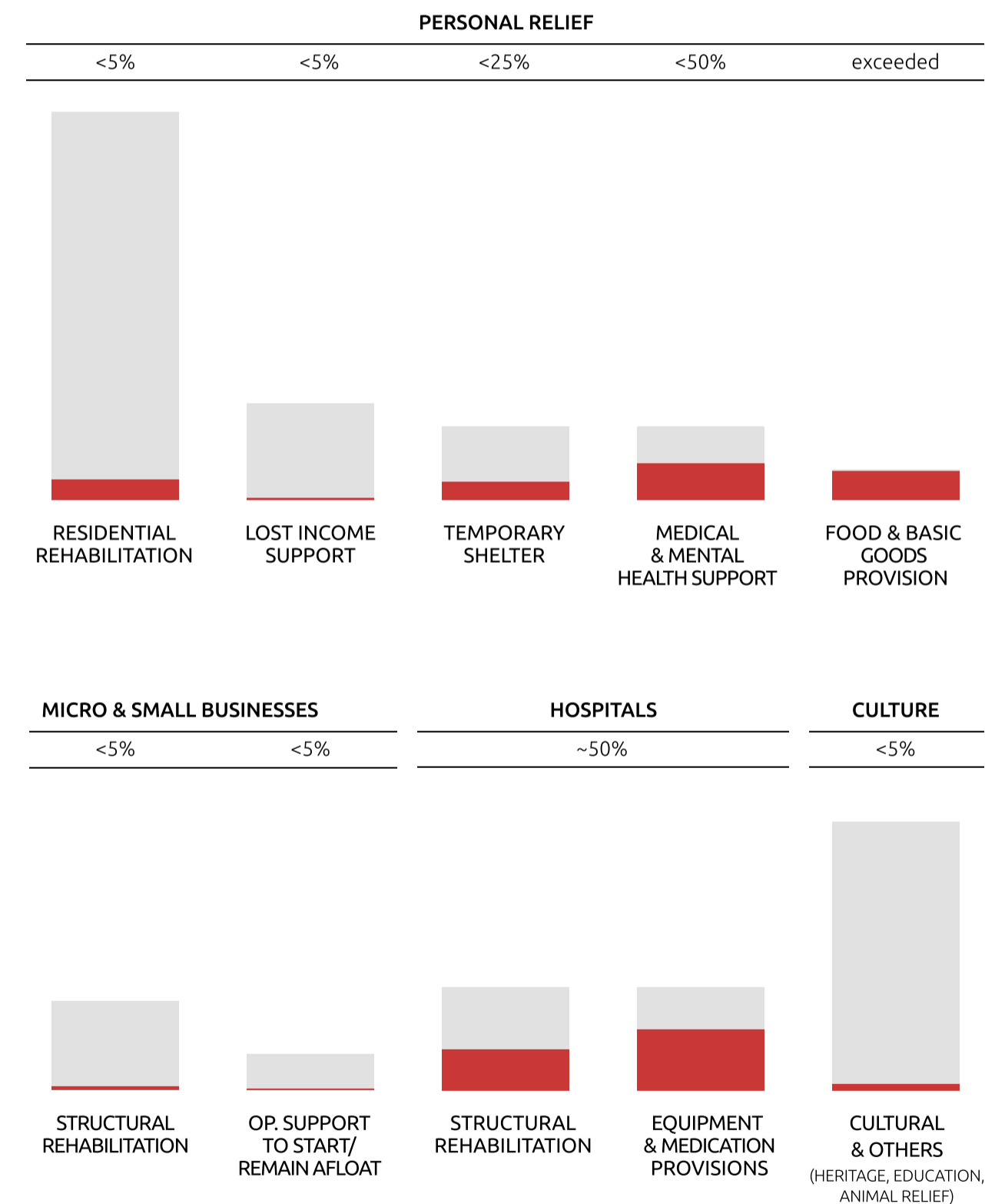
■ Met needs ■ Unmet needs % Funding allocated to date per need area